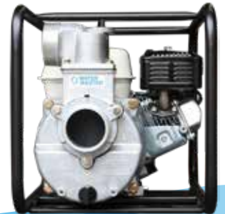
MH30-2 PUMP PERFORMANCE CURVE